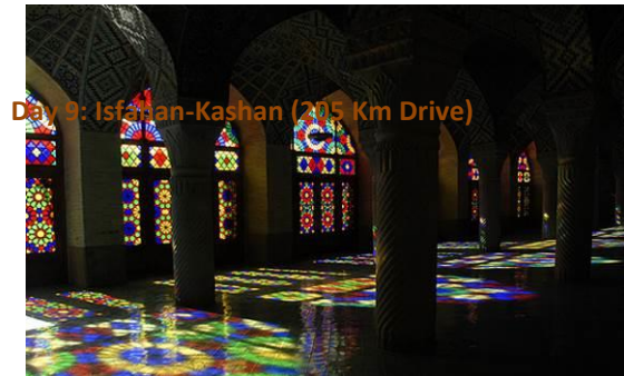
Day 9: Isfahan-Kashan (205 Km Drive)

In the Morning visit Isfahan Jam' e Mosque (World Heritage Site) and then drive to Kashan. En-Route, stop by Matin Abad to visit Desert Eco-Camp, Sand Dunes and Camel Riding. O/N Kashan.